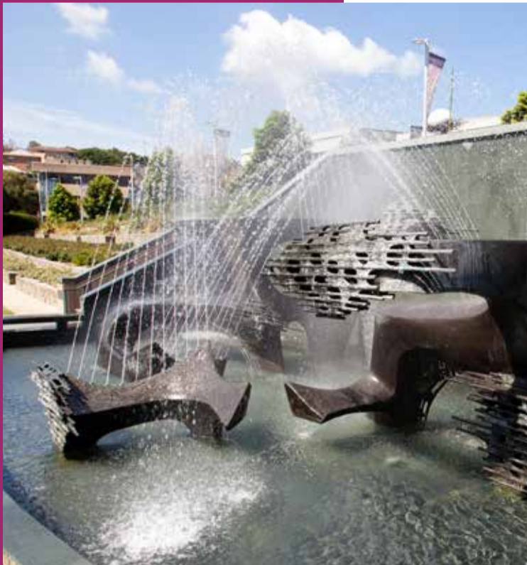
Captain James Cook Memorial Fountain (detail) Margel Hinder 1961–66, textured copper over steel structure, wall specially quarried porphyry 15.25 x 4.5 x 7.5m

Explore Newcastle's art and artists through a self-guided walking tour of the city.