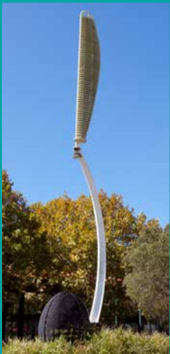
Foundation Seed John Turier 2005, steel and aluminium 14.0m height

Inside the camel are sculptures representing the mementos and culture people bring with them when they begin a new life in a new place. Among these items are objects that speak of Newcastle. The thistle is a reference to the city's Scottish heritage, while the hammer and sewing machine speak of industry and the canary of coal mining. The sculpture is affectionately called Constance by Newcastle Museum staff.