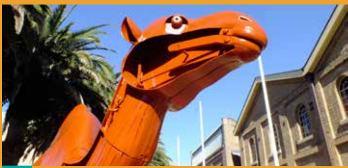
The Adaptable Migrant (detail) Suzie Bleach & Andrew Townsend 2012, mild steel with epoxy paint finish 198.0cm x 210.0cm