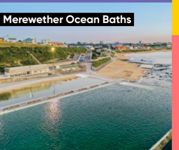
1. Nobbys Lighthouse 2. Newcastle Harbour 7. Bathers Way Walk 14. Blackbutt Reserve 15. Bogey Hole 16. Anzac Memorial Walk 17. Glenrock State Conservation Area 18. Merewether Ocean Baths